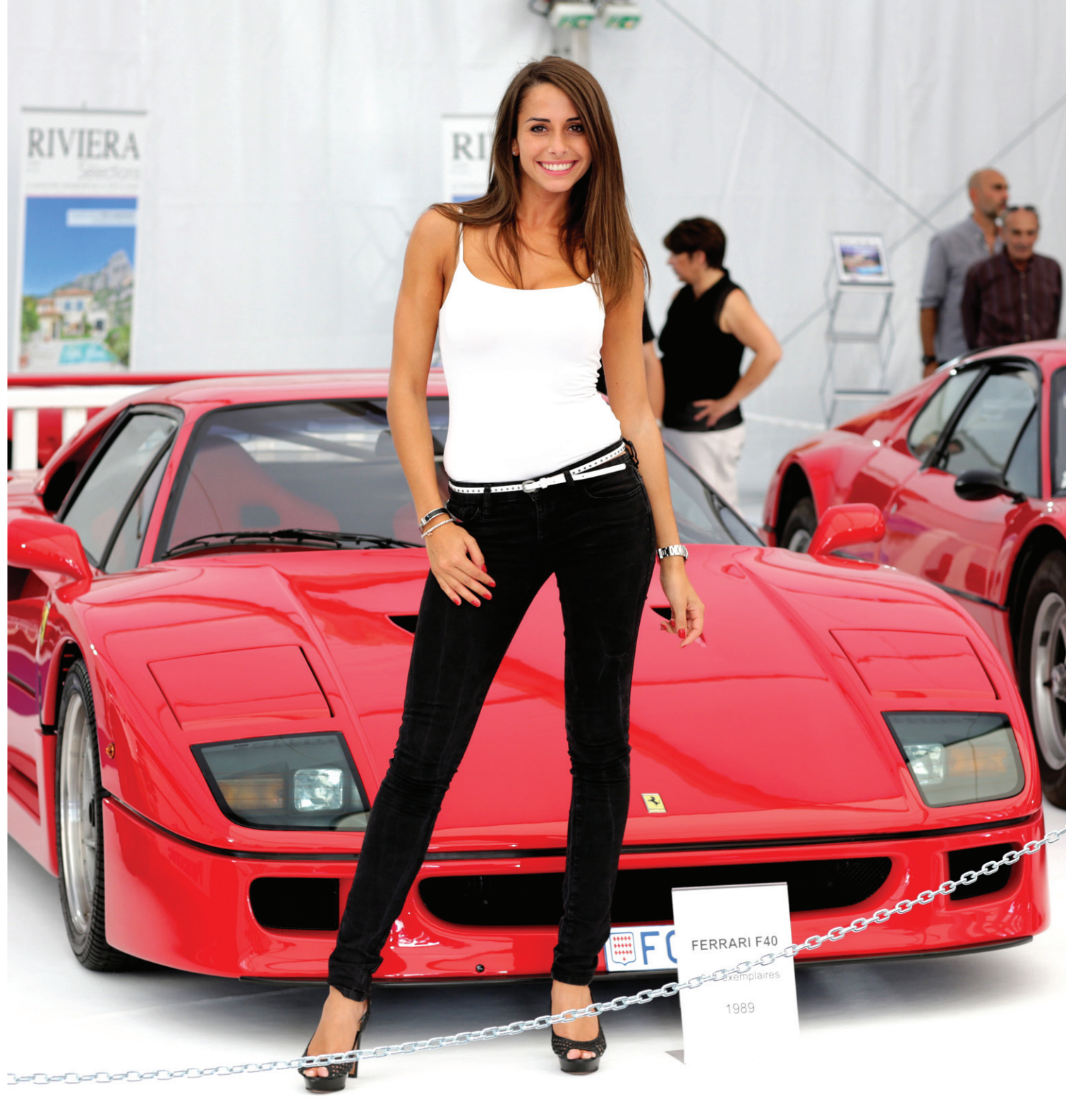
FERRARI F40 exemplaires 1989